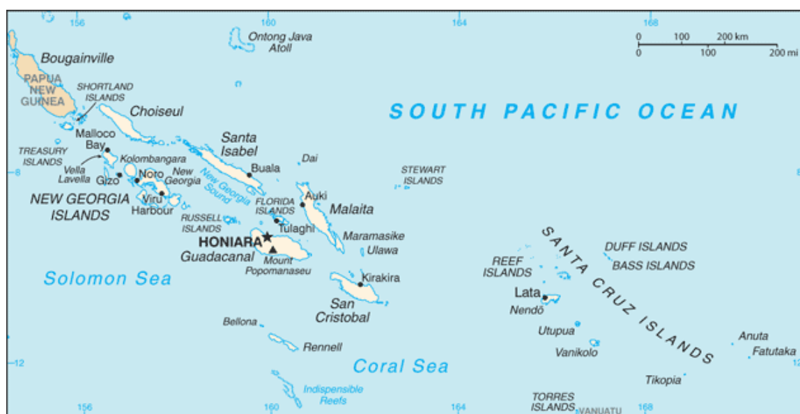
Figure 1 The highly dispersed provinces and islands of Solomon Islands. This Policy is for all Solomon Island communities in rural and urban regions, small and large islands, remote villages, towns and regional centres

( http://www.lib.utexas.edu/maps/cia12/solomon_islands_sm_2012.gif )