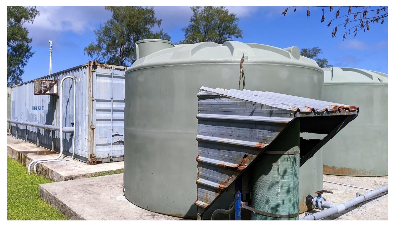
Figure 1. Container housing the Angaur treatment plant