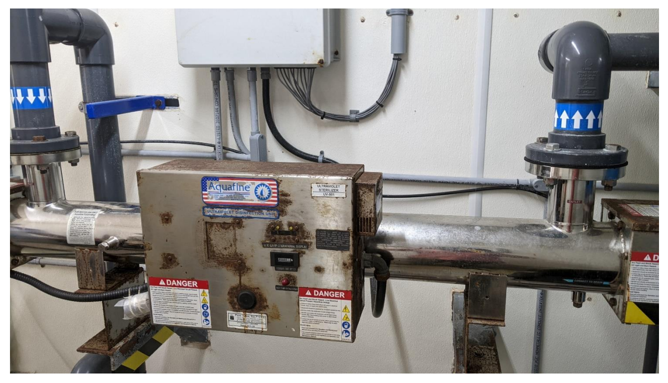
Figure 2. Faulty UV disinfector (Aquafine OPV02CDM OptiVenn Disinfection UV System, 146 GPM)