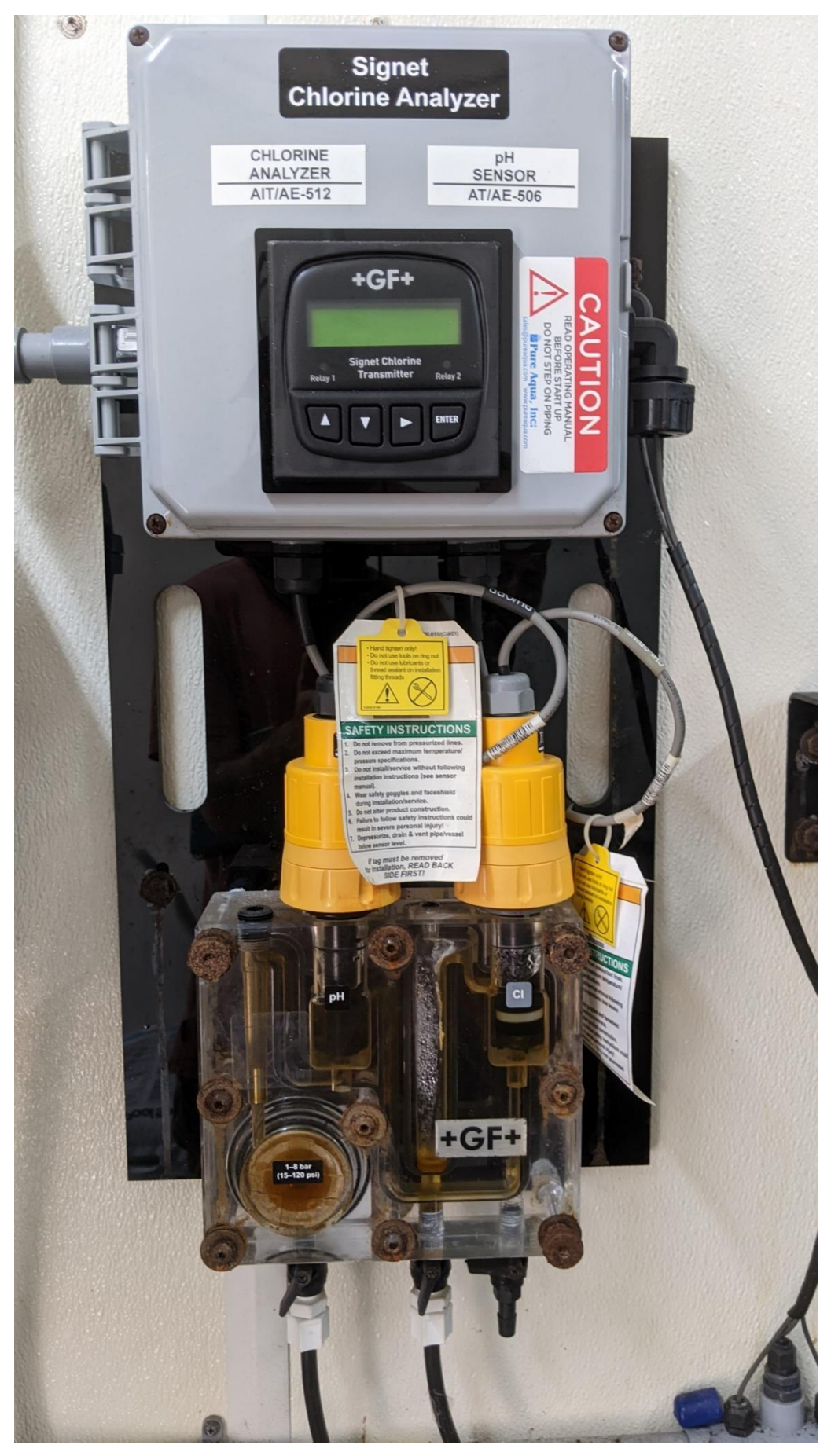
Figure 4. Faulty automatic chlorinator (GF Signet 4630 Chlorine Analyzer System)