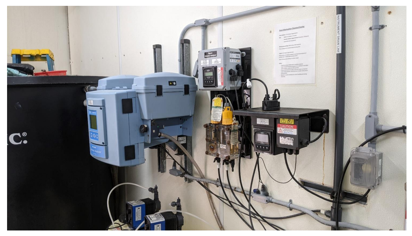
Figure 3. Treatment plant components