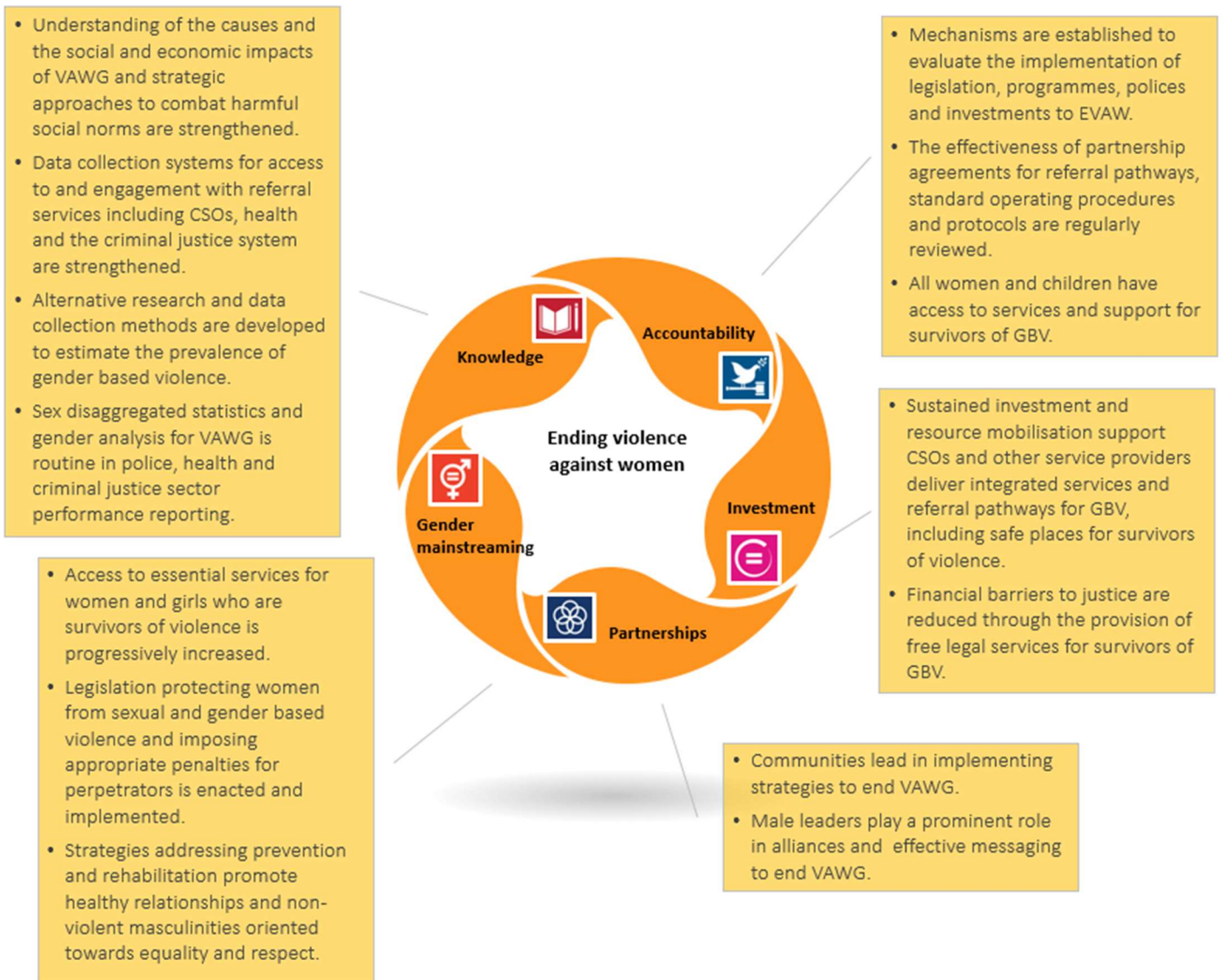
Figure 4. Summary of crosscutting strategies to achieve the PPA outcome – Ending violence against women