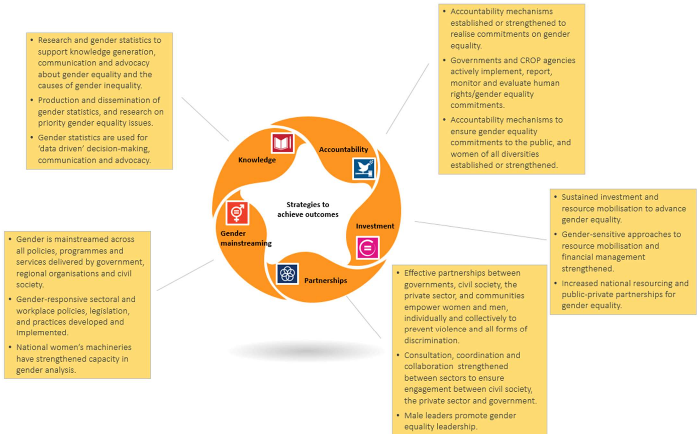
Figure 2. Summary of crosscutting strategies for achieving PPA outcomes