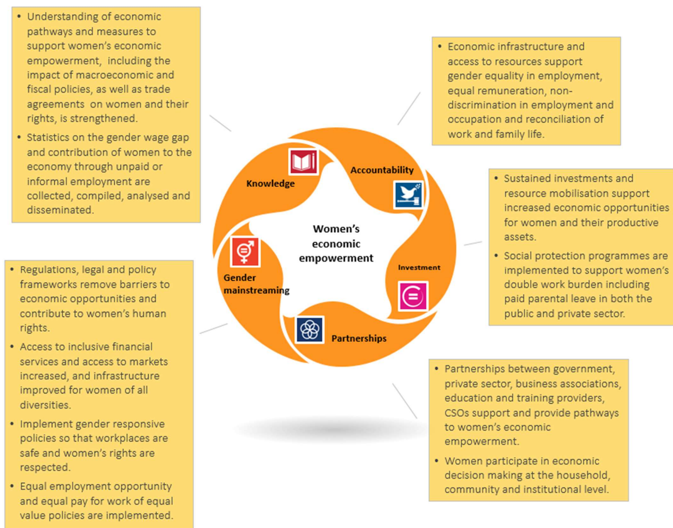
Figure 3. Summary of crosscutting strategies to achieve the PPA outcome – Women’s economic empowerment