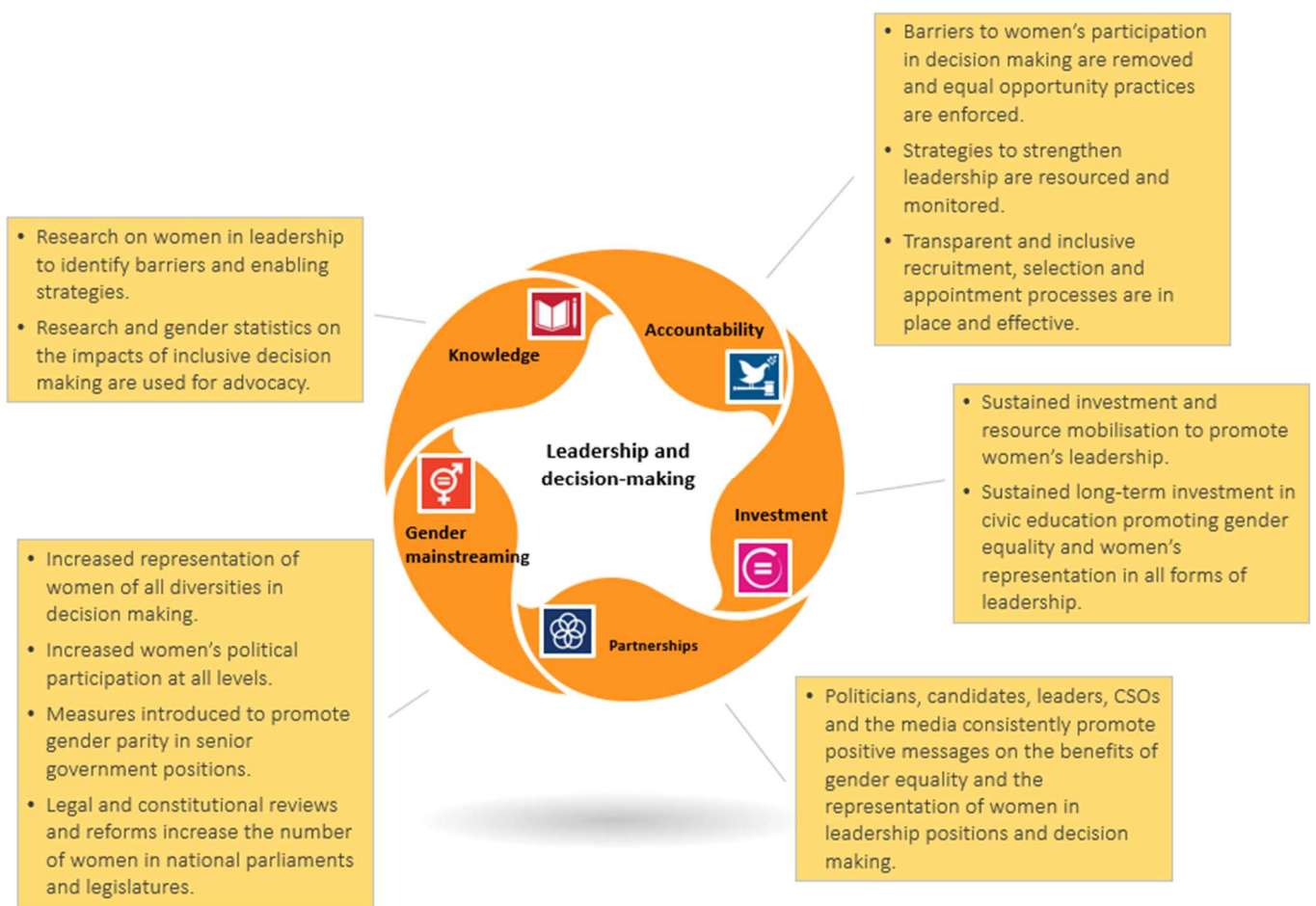
Figure 2. Summary of crosscutting strategies to achieve the PPA outcome – Leadership and decision-making

Accountability: 1) Demonstrate the removal of barriers to women’s participation in decision-making and enforce equal opportunity practices. 2) Resource and monitor strategies to strengthen leadership. 3) Ensure transparency and inclusiveness in recruitment, selection and appointment processes.