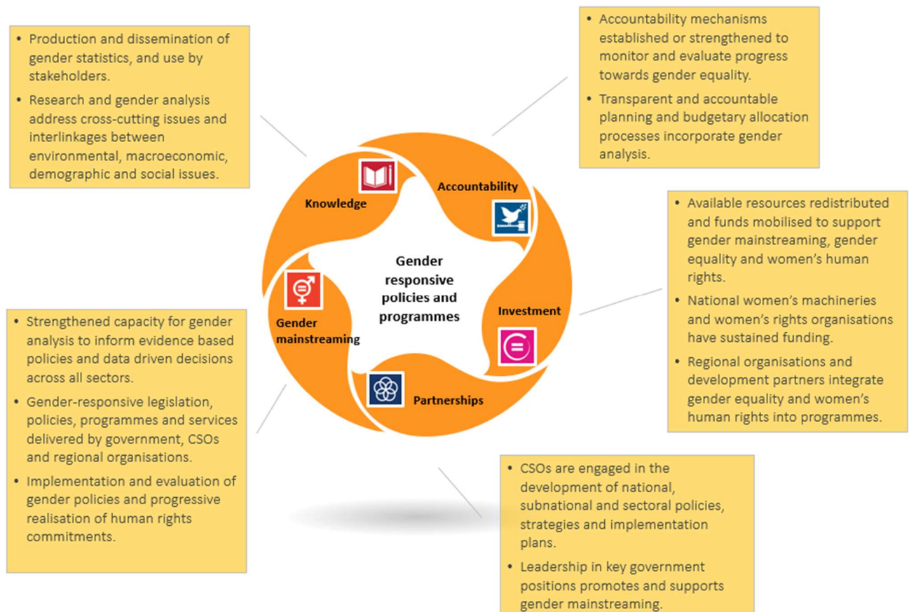
Figure 1. Summary of crosscutting strategies to achieve the PPA outcome – Gender responsive policies and programmes

The PPA also focuses on transforming harmful social norms and exclusionary practices.