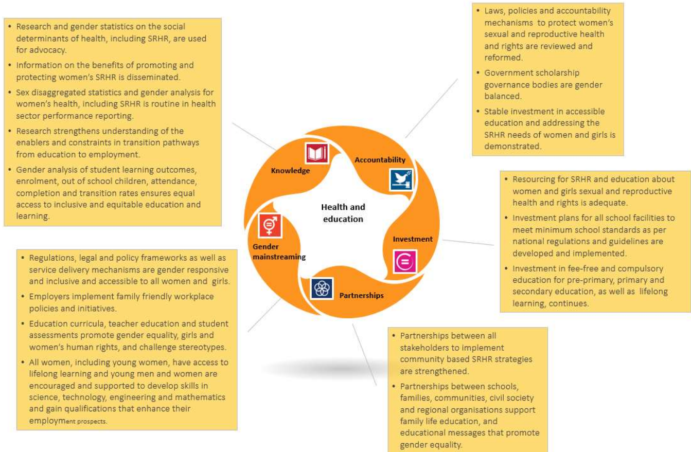
Figure 5. Summary of crosscutting strategies to achieve the PPA outcome – Health and education

Accountability: 1) Review and reform government laws, policies and accountability mechanisms to protect women’s SRHR. 2) Ensure gender equality in governance bodies responsible for selecting government scholarship recipients. 3) Demonstrate stable investment in accessible education and addressing the SRHR needs of women and girls.