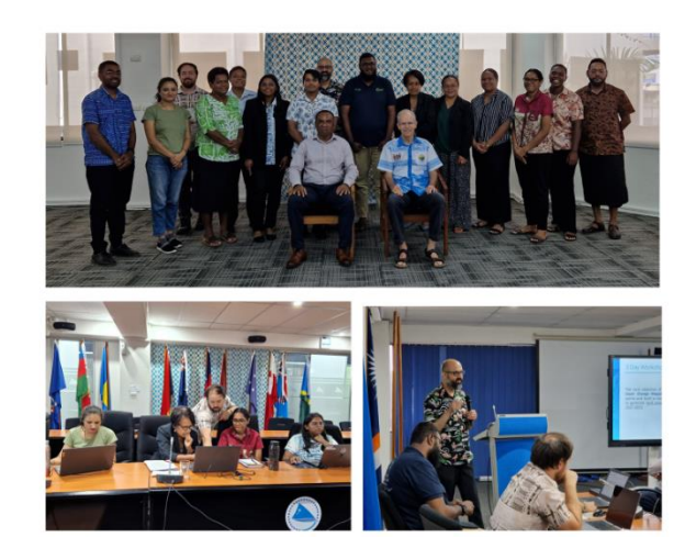
17 participants (65% female) across 9 ministries, academia, GIZ and U.S. Forestry Service. Follow-up workshop in June.